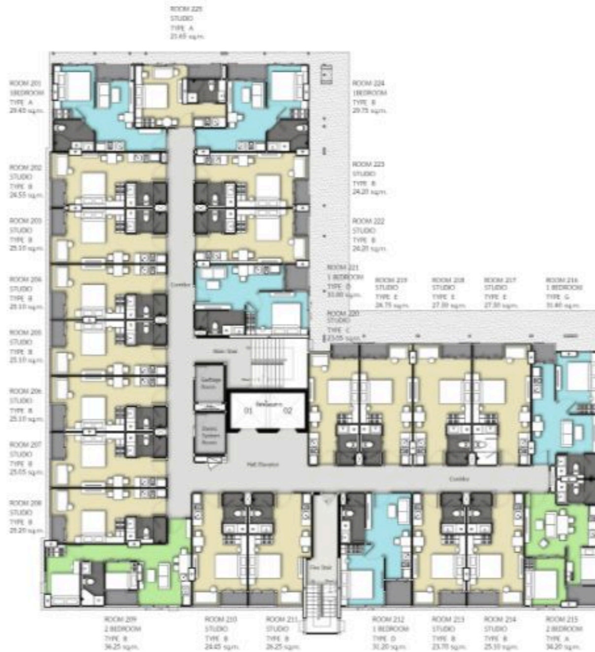
2nd-6th Floor Plan Scale 1:100