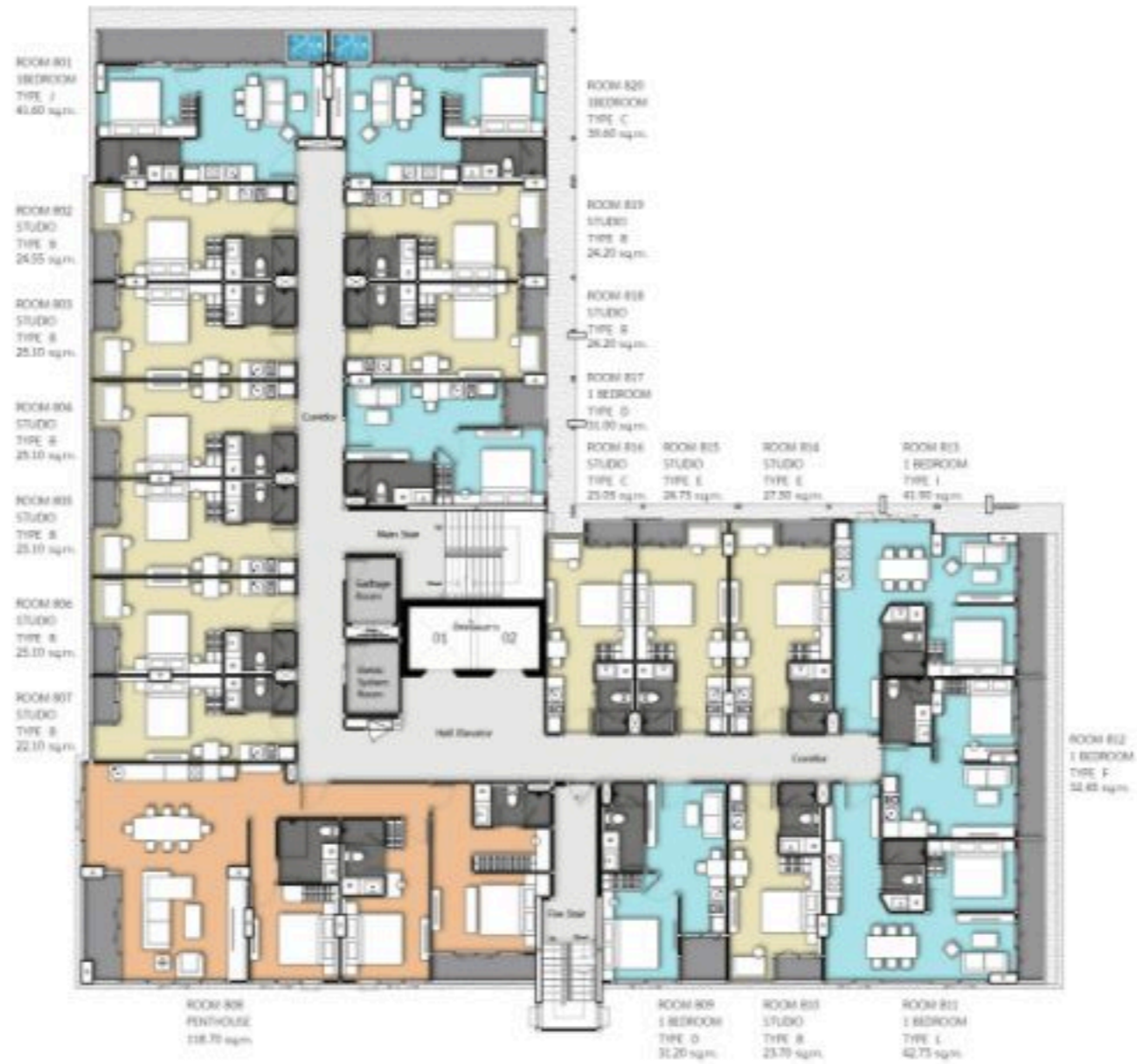
8th Floor Plan Scale 1:100 0 1 2 3 cm