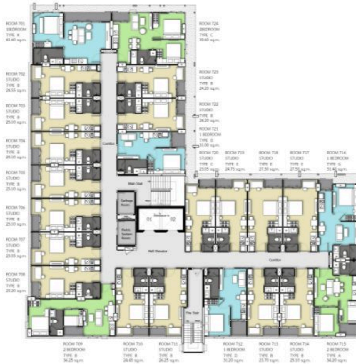
7th Floor Plan