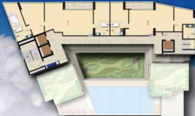
Penthouse B 110 sqm